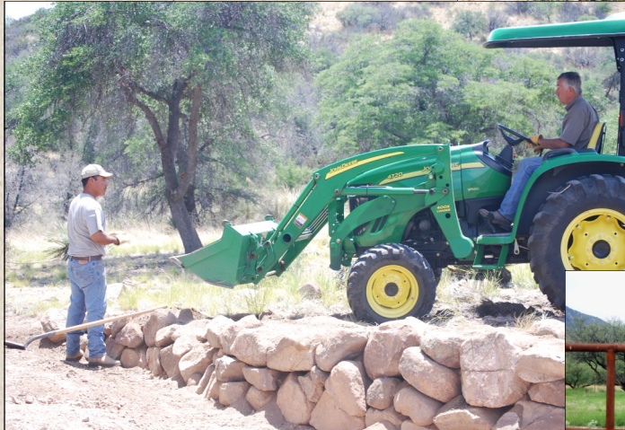
Laying up retaining wall