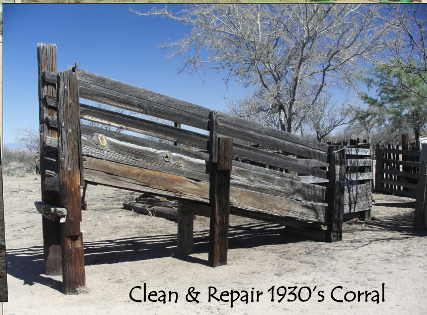
Clean & Repair 1930's Corral