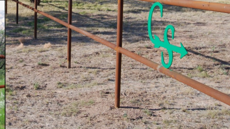
Fencing, Gates & Signs