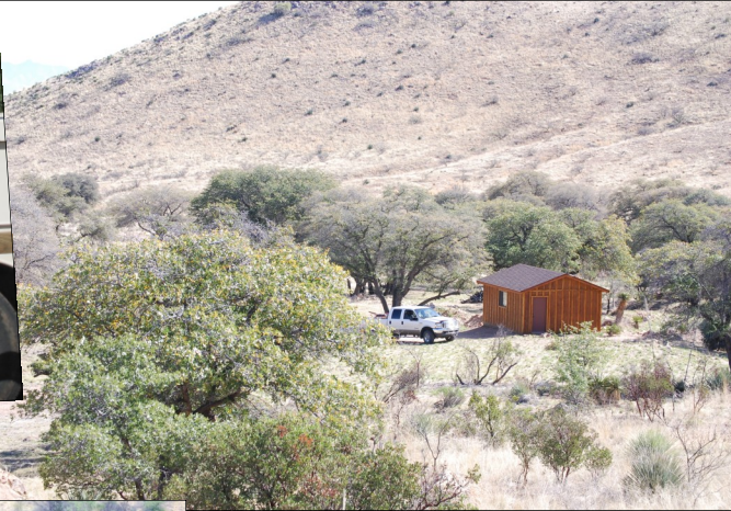
Pump House #2