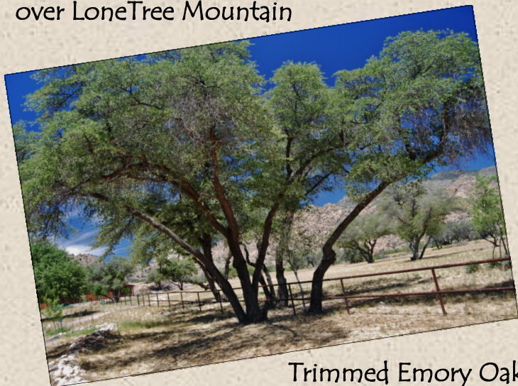
Trimmed Emory Oaks