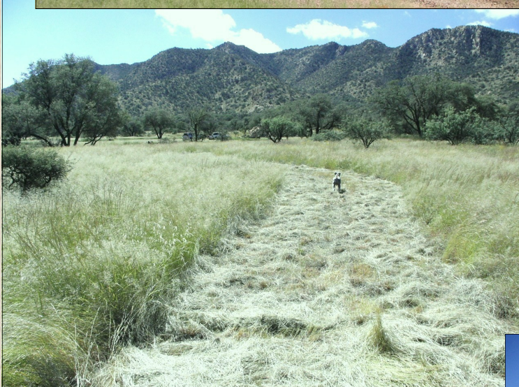
Buster checks out the new mown grasses