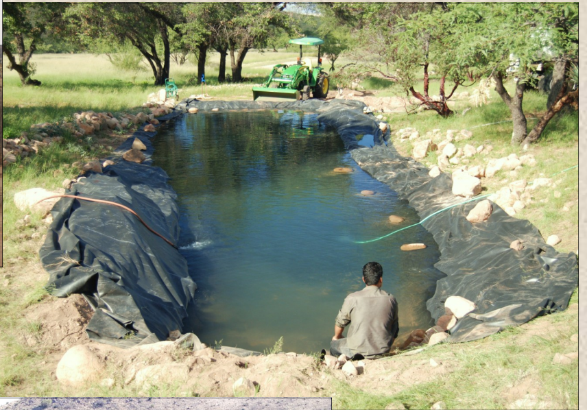
Building Koi Pond