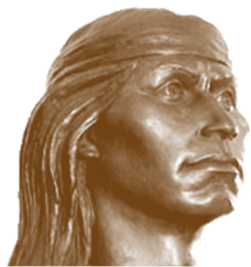
1800's Chiricahua Apache Leader COCHISE