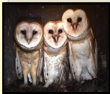
Barn Owls nesting again this year in the old hand dug well!