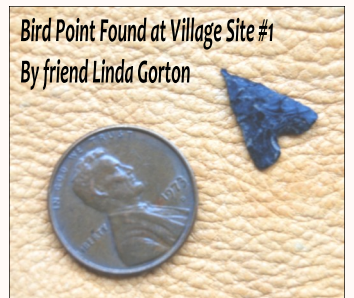
Bird Point Found at Village Site #1 By friend Linda Gorton

Research has shown that "Bird Points" were not actually used to kill birds, but, to take down large game such as deer!